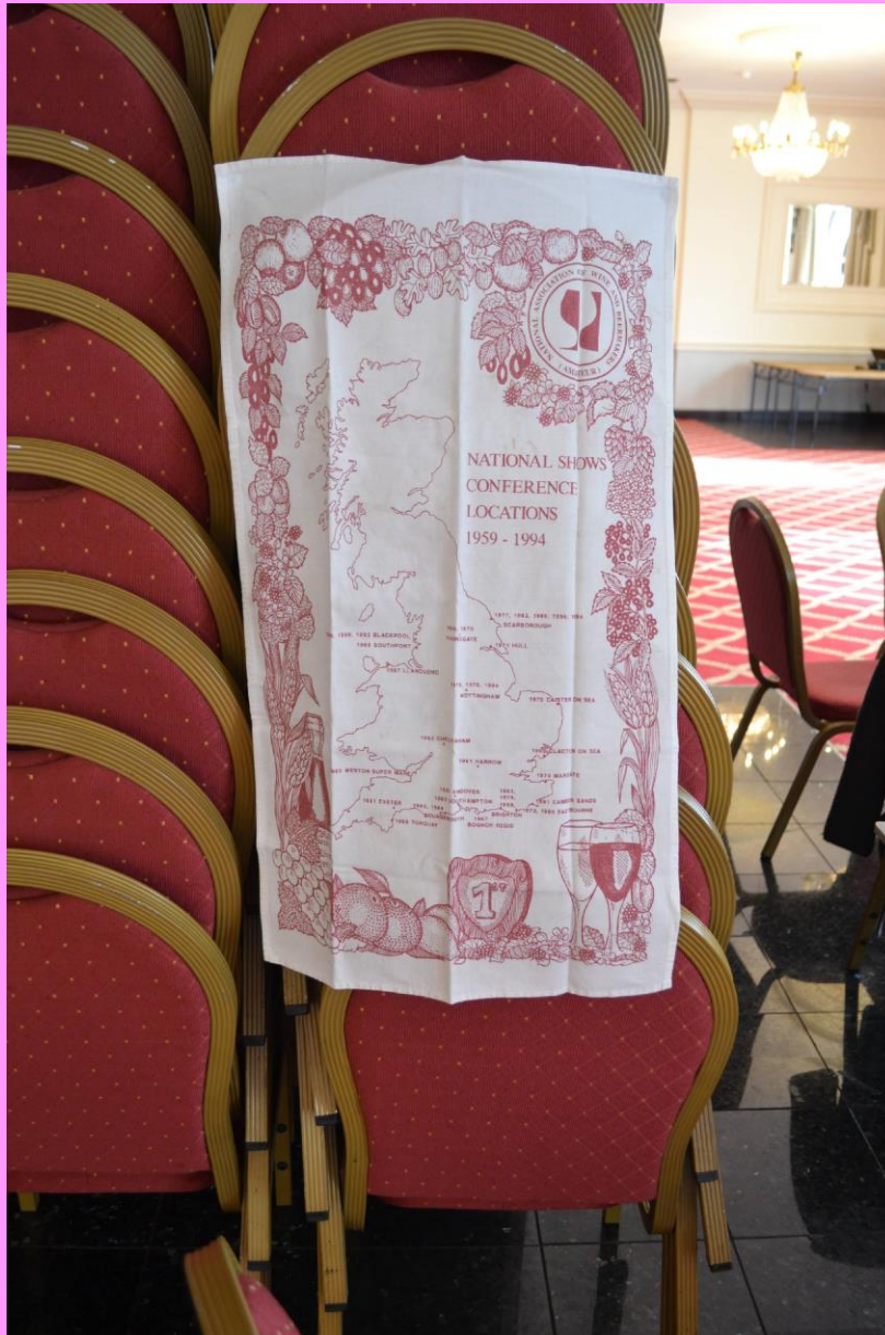
Tea Towel showing National Conference Locations from 1959 - 1994