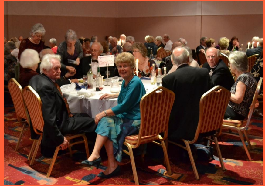
Brockworth & Burbage wine circles