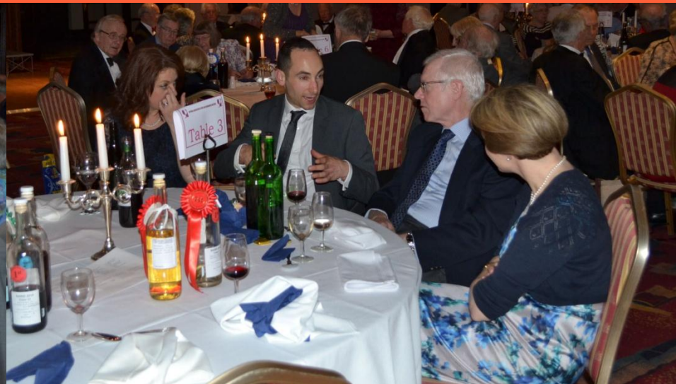
Luton Amateur Winemakers Guild