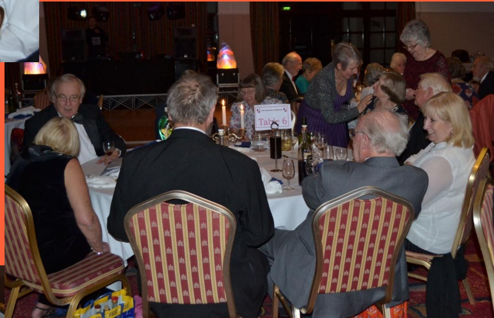
Nottingham Amateur Winemakers Association