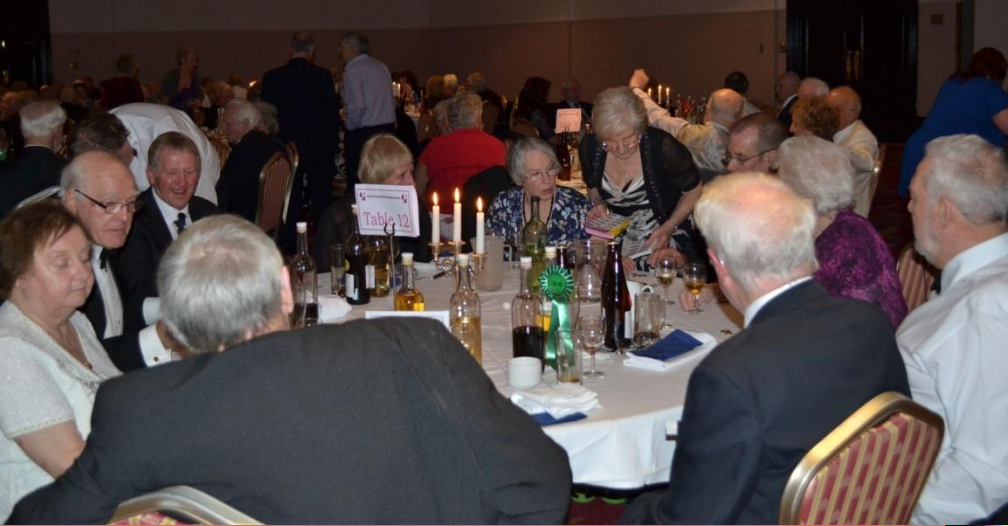
Chesterfield, Worksop, Tynemouth & friends