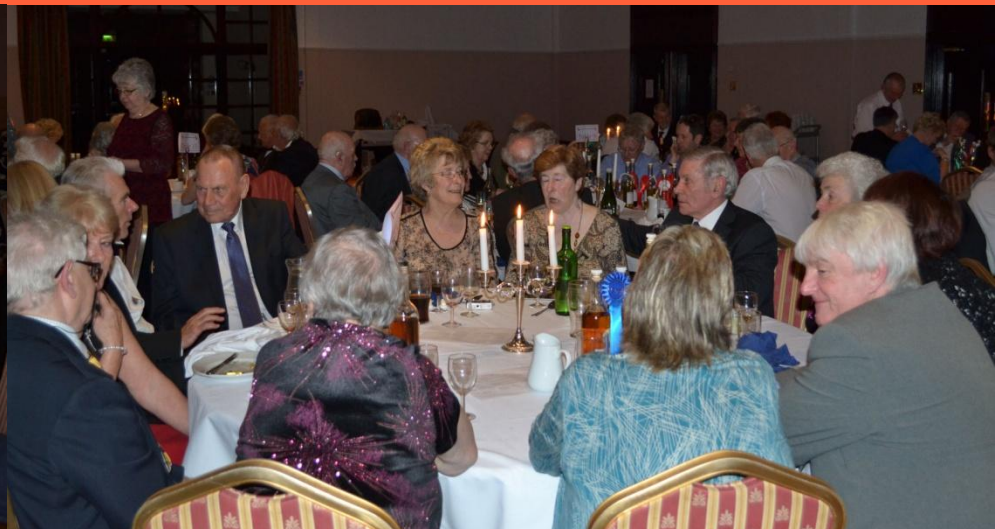
White Lion Wine Circle & friends